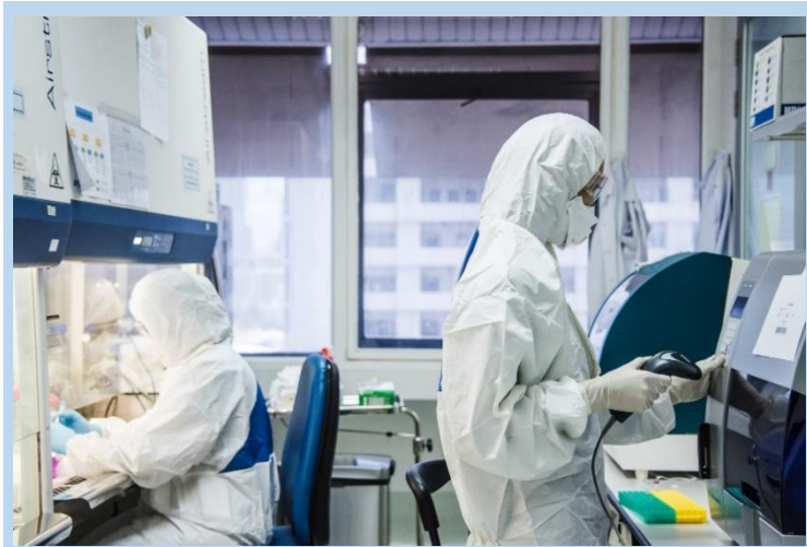
Staff of the Thai Red Cross Emerging Infectious Diseases-Health Science Centre at Chulalongkorn University in Bangkok examined patient samples.

Both epidemiologists in the field and scientists in the lab gained important experience responding to SARS in 2003, H1N1 in 2009 and MERS-CoV in 2016 – Thai public health authorities at all levels recognized the need for comprehensive preparedness and rapid action to manage emerging communicable diseases such as COVID-19. The population, also informed by experience with these pathogens, appreciated the need for measures such as handwashing, mask wearing and physical distancing.