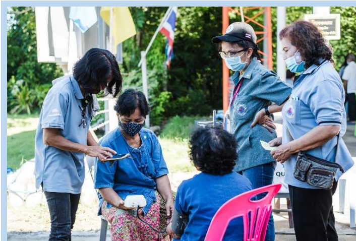
VHVs monitor the health condition of the elderly in the community.

consumer satisfaction with the health system. Putting the public interest first is a commitment ingrained in Thai health professionals 5 . During emergencies the Thai people trust their health system's capacity to respond in their best interests.