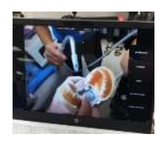
High power suction